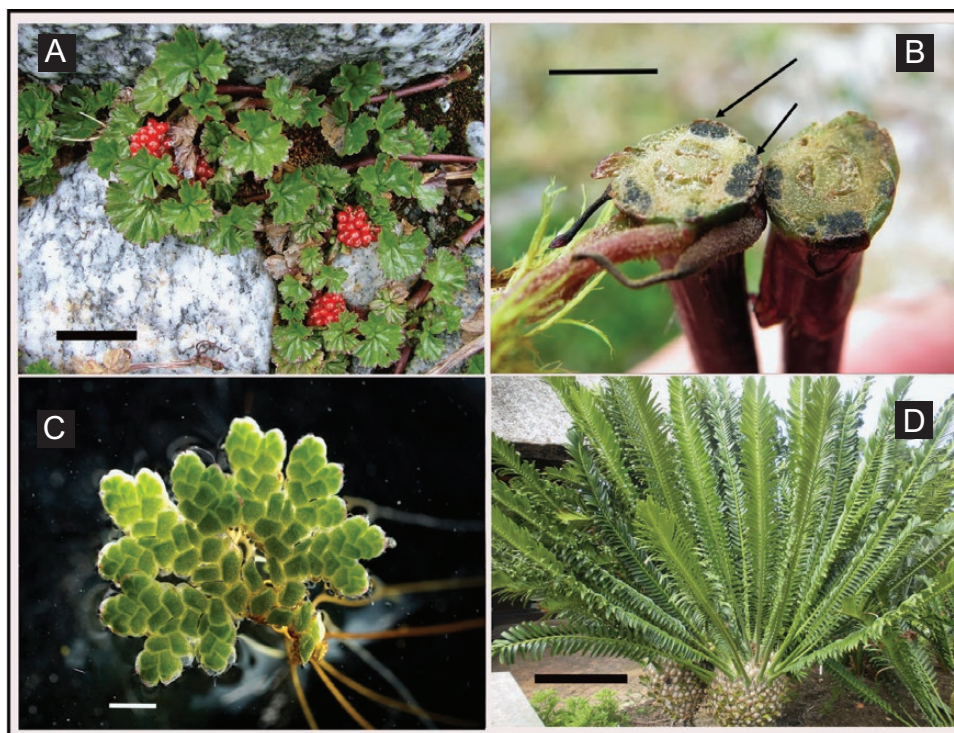
Figure 1. Pictures of plants analysed: A, Gunnera magellanica from Tierra del Fuego (bar is 5 cm); B, cross section of G. magellanica petiole bases showing cyanobacteria colonies (arrows point to colonies, bar is 1 cm); C, Azolla filiculoides (bar is 1 mm); D, Cycas species (bar is 30 cm).

When analysing the mineral contents of plants growing in front of receding Chilean glaciers, we discovered unusually high Na levels in the leaves of the locally common herbaceous angiosperm Gunnera magellanica (Fig. 1A). This occurred in the absence of elevated salt levels in the external medium and no other species growing in the same community with G. magellanica had elevated sodium levels in their leaves. The genus Gunnera is unusual in having symbiotic cyanobacteria in glands at the base of each petiole (Fig. 1B) which carry out nitrogen fixation (Silvester and Smith 1969; Osborne and Bergman 2009). We reasoned that if high accumulation of sodium is obligate in plants with symbiotic association with cyanobacteria, we should be able to detect this unusual trait in other plants with this symbiosis. We extended our analyses to plants that were taxonomically diverse with representatives from the angiosperms, gymnosperms and ferns and all sharing the unusual