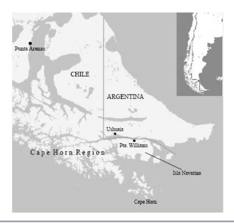
Fig. 1. The Cape Horn Region.

set up with the aim of providing a framework for sustainably protecting and developing the region.